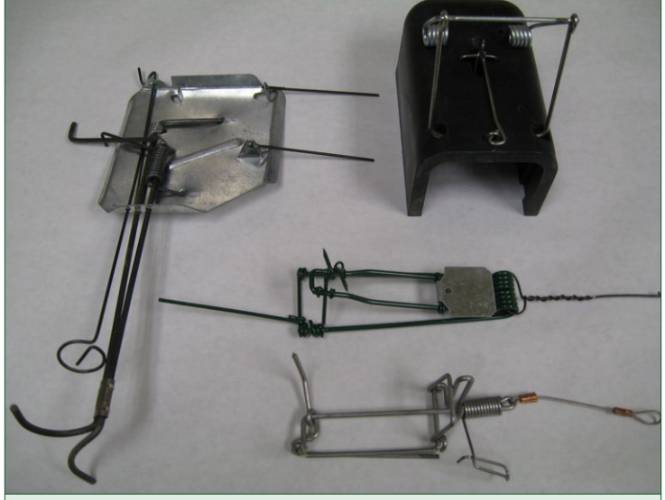
Figure 2. Types and brands of gopher traps include (clockwise from upper right) Victor Black Box, Macabee, Gophinator, and Cinch.

It can be helpful to tie a flag to the traps so you can