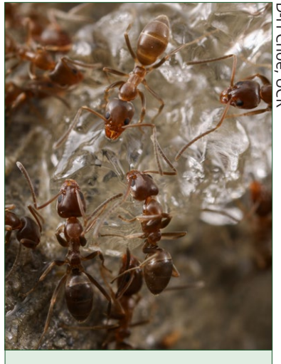
Figure 2. Ants consuming a gel bait.

Figure 1. Perimeter spray for ant management around a home.