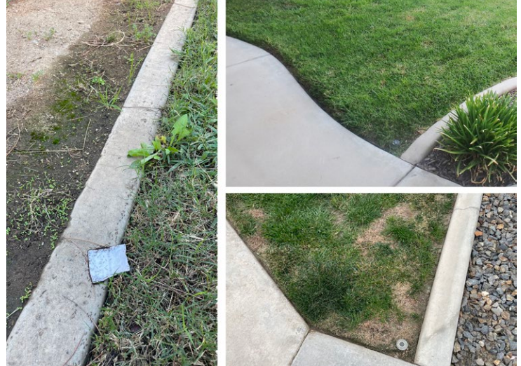
Figure 4. Examples of lawn-concrete interface in residential settings. The picture on the left shows one of the lawn-concrete sites tested in the experiment.