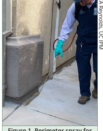
Figure 1. Perimeter spray for ant management around a home.

Baiting (Figure 2) can reduce the need for insecticide spray applications. Active incorporation of baits in a management program may help to lower the risk of environmental contamination caused by insecticide drift and run-off. For Argentine ants, which often form large colonies with multiple nest sites and reproducing queens, the initial application of perimeter spray would be still needed to provide a quick knockdown of foraging ant populations during peak season (June or July). However, baits are particularly useful for subsequent maintenance visits (monthly or bimonthly). In fact, baiting has