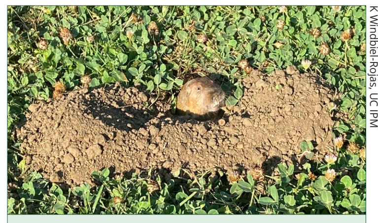
Figure 1. Pocket gopher looking out of its mound in a cloverfilled lawn.

Trapping is an excellent option for managing pocket gophers, even if you think you have a large population. In general, there is only one pocket gopher per tunnel system, so once you have captured one, you can move to the next system. Be aware that during the breeding season, there could be both a male and female in the burrow system, and after the female gives birth and the pups are dispersing, you can find the pups in the burrow system with reproducing